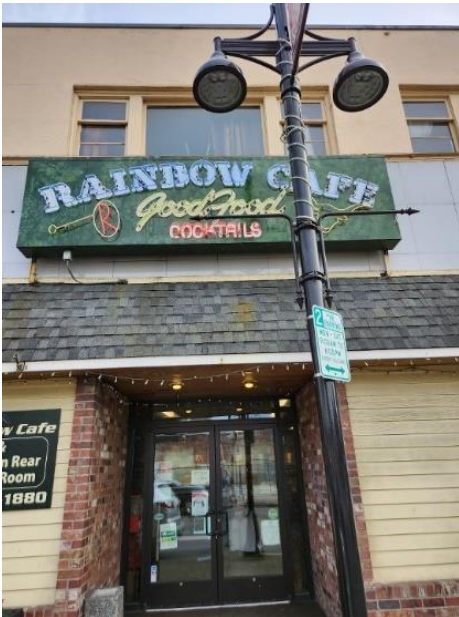
Front Entrance to Rainbow Cafe