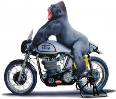
Future Ride Coordinator(s)