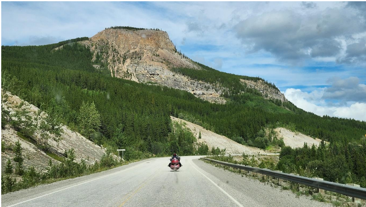
Haines Junction to Watson Lake in British Columbia

Have you checked out the Chapter "A" Website lately? Our Webmaster works on it almost daily, Check it out!